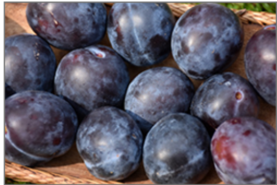
Mount Royal Plum fruit