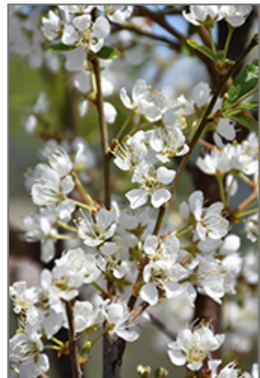
Toka Plum flowers