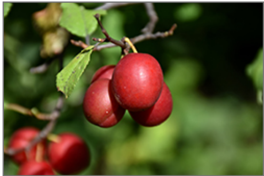
Toka Plum fruit