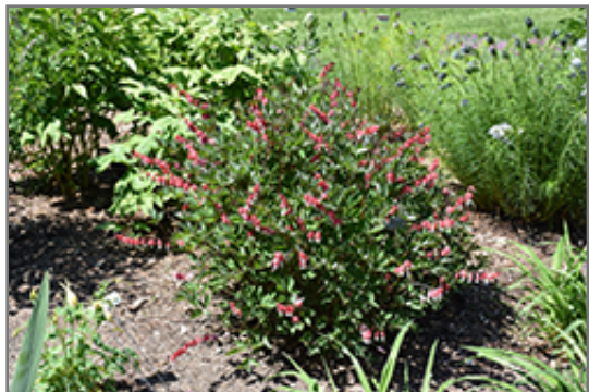
Valentine Bleeding Heart in bloom