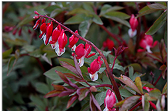
Valentine Bleeding Heart flowers

Valentine Bleeding Heart is recommended for the following landscape applications;