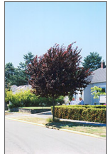
Newport Plum