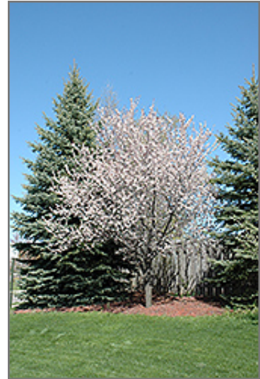
Newport Plum in bloom

This tree should only be grown in full sunlight. It does best in average to evenly moist conditions, but will not tolerate standing water. It is not particular as to soil type or pH. It is highly tolerant of urban pollution and will even thrive in inner city environments. This is a selected variety of a species not originally from North America.