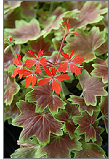
Vancouver Centennial Geranium flowers