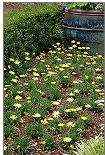
Voltage Yellow African Daisy flowers