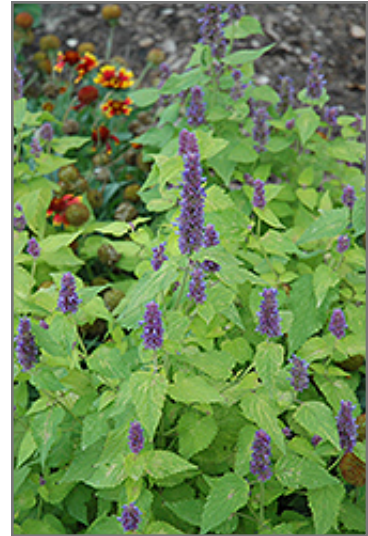
Golden Jubilee Anise Hyssop flowers

Golden Jubilee Anise Hyssop is a dense herbaceous perennial with an upright spreading habit of growth. Its medium texture blends into the garden, but can always be balanced by a couple of finer or coarser plants for an effective composition.