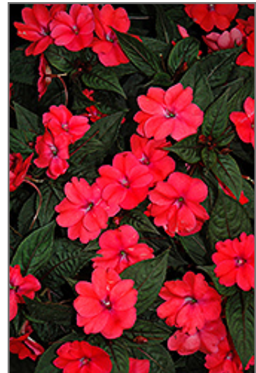
SunPatiens Compact Deep Rose New Guinea Impatiens flowers

This plant will require occasional maintenance and upkeep, and should not require much pruning, except when necessary, such as to remove dieback. It is a good choice for attracting bees and butterflies to your yard. It has no significant negative characteristics.