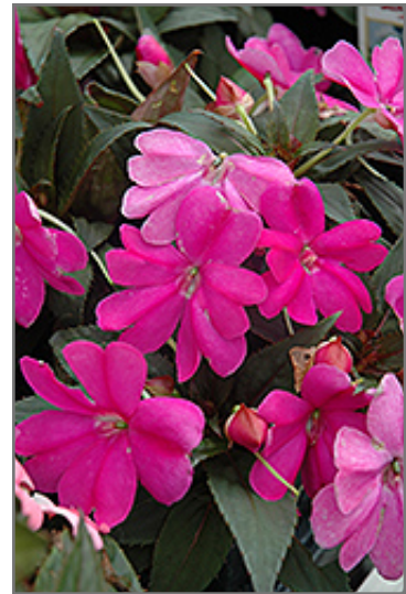
SunPatiens Compact Lilac New Guinea Impatiens flowers

SunPatiens Compact Lilac New Guinea Impatiens is recommended for the following landscape applications;