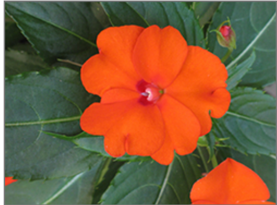
Infinity Orange New Guinea Impatiens flowers

This plant will require occasional maintenance and upkeep, and should not require much pruning, except when necessary, such as to remove dieback. It has no significant negative characteristics.