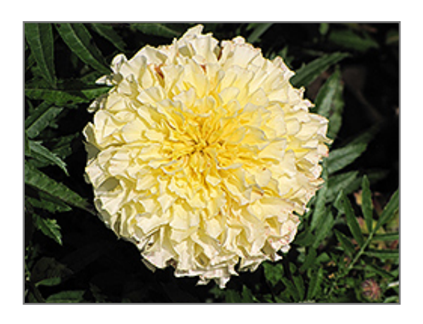
Vanilla Marigold flowers