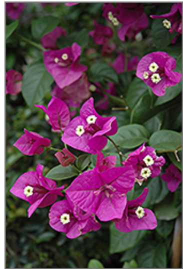
Purple Queen Bougainvillea flowers