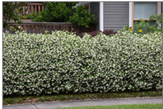
Confederate Star-Jasmine in bloom