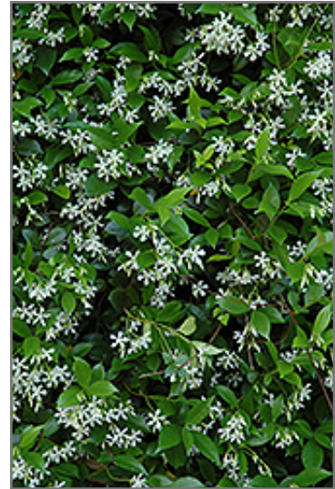
Confederate Star-Jasmine flowers