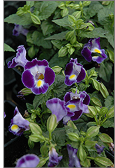
Catalina Midnight Blue Torenia flowers

Catalina Midnight Blue Torenia is recommended for the following landscape applications;