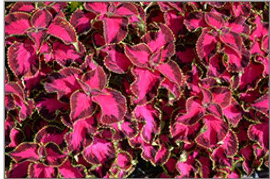
Chocolate Covered Cherry Coleus foliage

Chocolate Covered Cherry Coleus will grow to be about 12 inches tall at maturity, with a spread of 12 inches. When grown in masses or used as a bedding plant, individual plants should be spaced approximately 10 inches apart. Although it's not a true annual, this fast-growing plant can be expected to behave as an annual in our climate if left outdoors over the winter, usually needing replacement the following year. As such, gardeners should take into consideration that it will perform differently than it would in its native habitat.