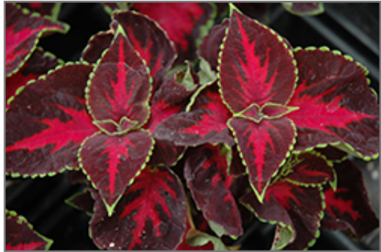
Chocolate Covered Cherry Coleus foliage