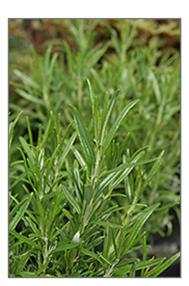
Barbeque Sky Rosemary foliage

This plant is quite ornamental as well as edible, and is as much at home in a landscape or flower garden as it is in a designated herb garden. It should only be grown in full sunlight. It prefers dry to average moisture levels with very well-drained soil, and will often die in standing water. It is not particular as to soil type or pH. It is highly tolerant of urban pollution and will even thrive in inner city environments. Consider applying a thick mulch around the root zone in winter to protect it in exposed locations or colder microclimates. This is a selected variety of a species not originally from North America.