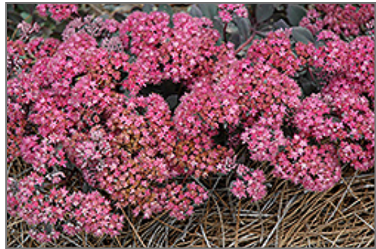
Dazzleberry Stonecrop flowers

Dazzleberry Stonecrop is a dense herbaceous perennial with an upright spreading habit of growth. Its medium texture blends into the garden, but can always be balanced by a couple of finer or coarser plants for an effective composition.