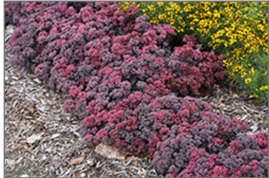
Dazzleberry Stonecrop in bloom