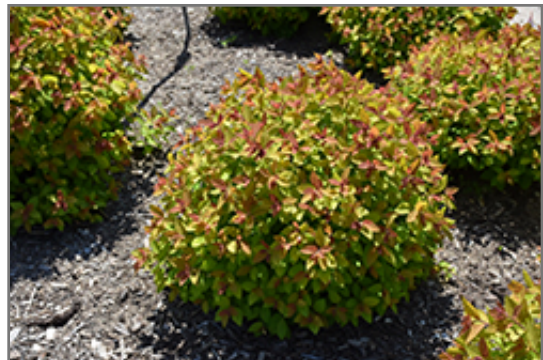
Double Play Big Bang Spirea