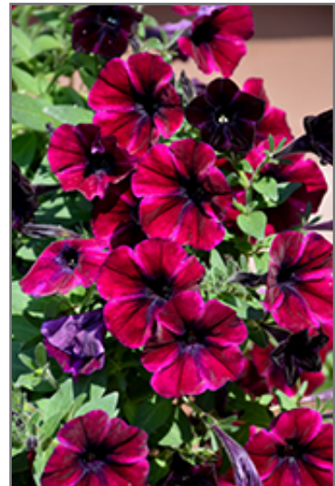
Sweetunia Johnny Flame Petunia flowers