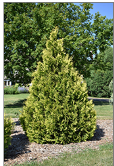
Yellow Ribbon Arborvitae