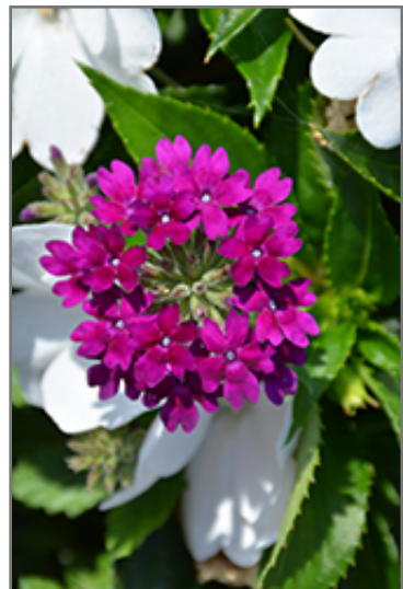
Superbena Royale Plum Wine Verbena flowers