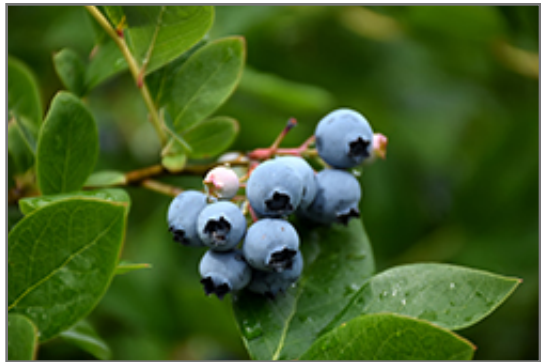
Northcountry Blueberry fruit

Northcountry Blueberry features dainty clusters of white bell-shaped flowers with shell pink overtones hanging below the branches in mid spring. It has green deciduous foliage. The glossy oval leaves turn an outstanding scarlet in the fall. It features an abundance of magnificent blue berries in mid summer.