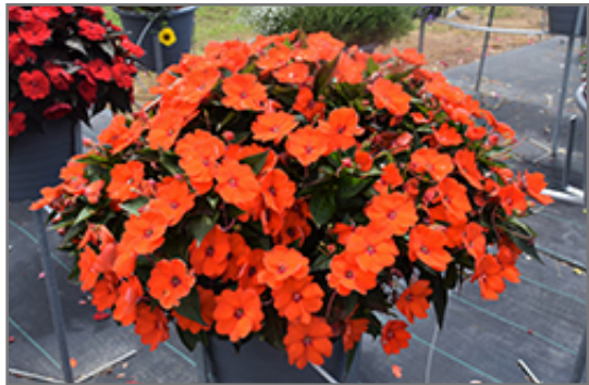
SunPatiens Compact Electric Orange New Guinea Impatiens in bloom

SunPatiens Compact Electric Orange New Guinea Impatiens is a fine choice for the garden, but it is also a good selection for planting in outdoor containers and hanging baskets. It can be used either as 'filler' or as a 'thriller' in the 'spiller-thriller-filler' container combination, depending on the height and form of the other plants used in the container planting. It is even sizeable enough that it can be grown alone in a suitable container. Note that when growing plants in outdoor containers and baskets, they may require more frequent waterings than they would in the yard or garden.