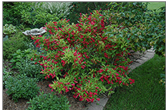
Red Prince Weigela in bloom