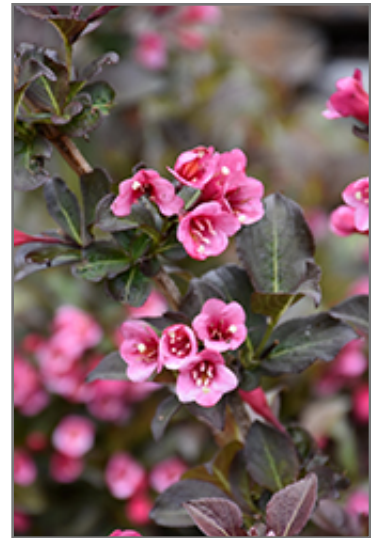
Tango Weigela flowers

Tango Weigela is recommended for the following landscape applications;