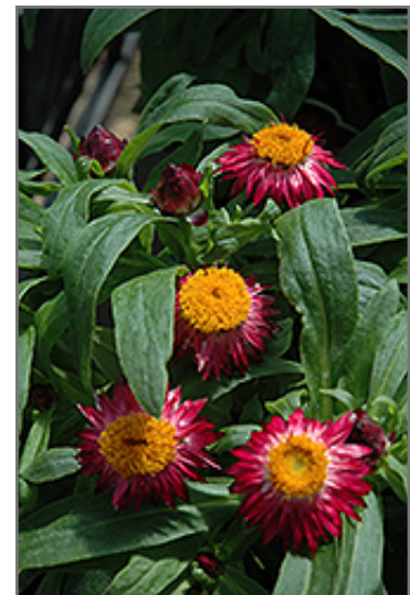
Mohave Dark Red Strawflower flowers