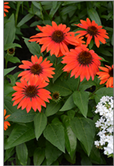
Sombrero Flamenco Orange Coneflower in bloom

Sombrero Flamenco Orange Coneflower is recommended for the following landscape applications;