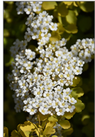
Glow Girl Birch Leaf Spirea flowers