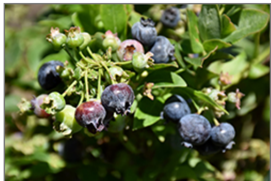
Jelly Bean Blueberry fruit