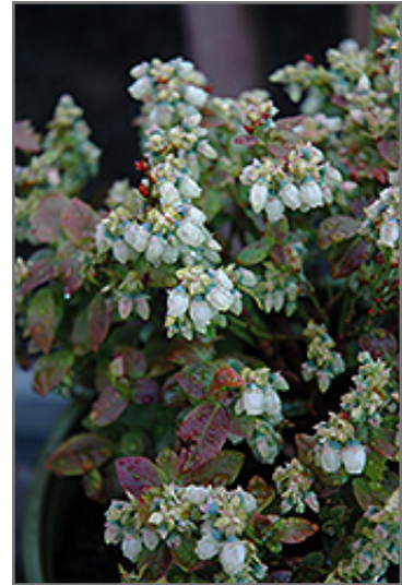
Jelly Bean Blueberry flowers

Jelly Bean Blueberry is a good choice for the edible garden, but it is also well-suited for use in outdoor pots and containers. It can be used either as 'filler' or as a 'thriller' in the 'spiller-thriller-filler' container combination, depending on the height and form of the other plants used in the container planting. It is even sizeable enough that it can be grown alone in a suitable container. Note that when grown in a container, it may not perform exactly as indicated on the tag - this is to be expected. Also note that when growing plants in outdoor containers and baskets, they may require more frequent waterings than they would in the yard or garden. Be aware that in our climate, most plants cannot be expected to survive the winter if left in containers outdoors, and this plant is no exception. Contact our experts for more information on how to protect it over the winter months.