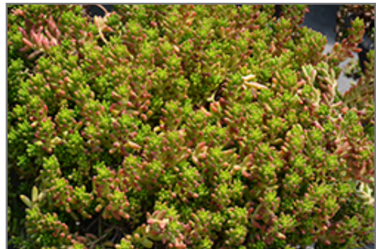
Jelly Bean Plant