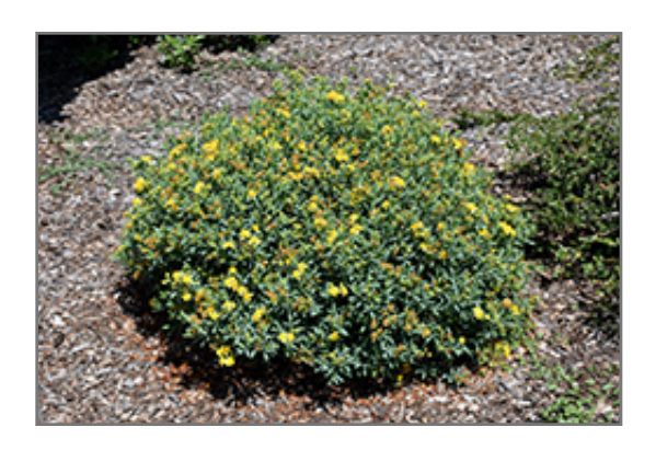
Cobalt-n-Gold St. John's Wort in bloom