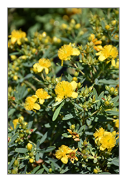
Cobalt-n-Gold St. John's Wort flowers