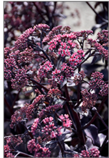
Cherry Truffle Stonecrop flowers

Cherry Truffle Stonecrop is a dense herbaceous perennial with an upright spreading habit of growth. Its medium texture blends into the garden, but can always be balanced by a couple of finer or coarser plants for an effective composition.