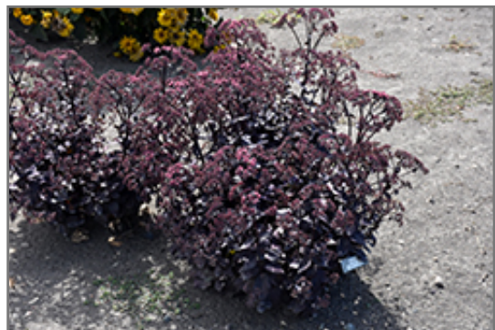
Cherry Truffle Stonecrop in bloom