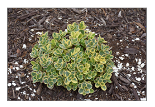
Lime Twister Stonecrop

Lime Twister Stonecrop will grow to be only 4 inches tall at maturity extending to 6 inches tall with the flowers, with a spread of 18 inches. When grown in masses or used as a bedding plant, individual plants should be spaced approximately 15 inches apart. Its foliage tends to remain low and dense right to the ground. It grows at a fast rate, and under ideal conditions can be expected to live for approximately 15 years. As an herbaceous perennial, this plant will usually die back to the crown each winter, and will regrow from the base each spring. Be careful not to disturb the crown in late winter when it may not be readily seen!