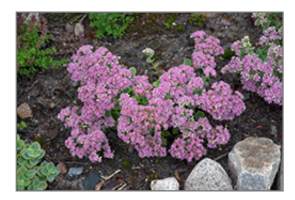
Lime Twister Stonecrop in bloom