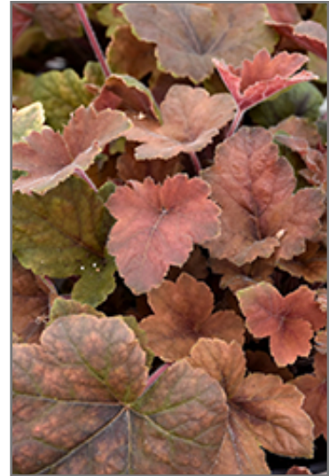
Pumpkin Spice Foamy Bells foliage

Pumpkin Spice Foamy Bells is recommended for the following landscape applications;