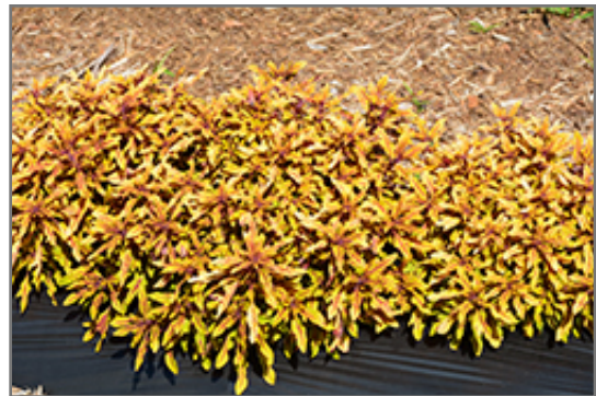
Hipsters Zooey Coleus