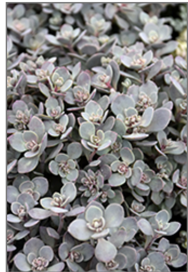
SunSparkler Blue Elf Sedoro foliage