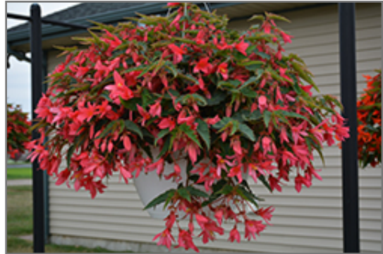
Bossa Nova Pink Glow Begonia in bloom

Bossa Nova Pink Glow Begonia is a fine choice for the garden, but it is also a good selection for planting in outdoor containers and hanging baskets. Because of its trailing habit of growth, it is ideally suited for use as a 'spiller' in the 'spiller-thriller-filler' container combination; plant it near the edges where it can spill gracefully over the pot. Note that when growing plants in outdoor containers and baskets, they may require more frequent waterings than they would in the yard or garden.