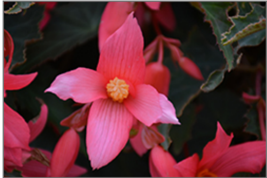
Bossa Nova Pink Glow Begonia flowers

This is a high maintenance plant that will require regular care and upkeep, and usually looks its best without pruning, although it will tolerate pruning. Deer don't particularly care for this plant and will usually leave it alone in favor of tastier treats. Gardeners should be aware of the following characteristic(s) that may warrant special consideration;