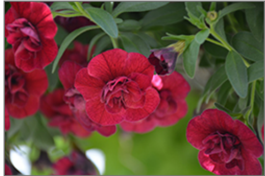
Superbells Double Ruby Calibrachoa flowers

Superbells Double Ruby Calibrachoa is recommended for the following landscape applications;