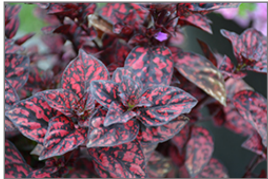
Hippo Red Polka Dot Plant foliage

Hippo Red Polka Dot Plant is recommended for the following landscape applications;