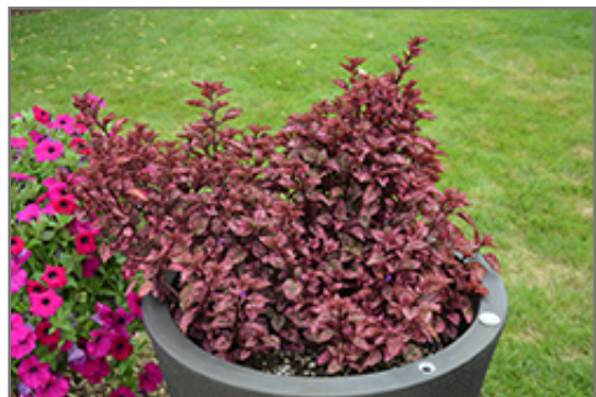
Hippo Rose Polka Dot Plant