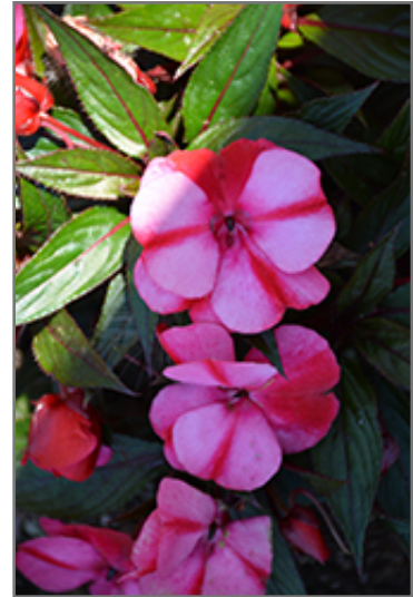
Infinity Blushing Crimson New Guinea Impatiens flowers

Infinity Blushing Crimson New Guinea Impatiens is recommended for the following landscape applications;