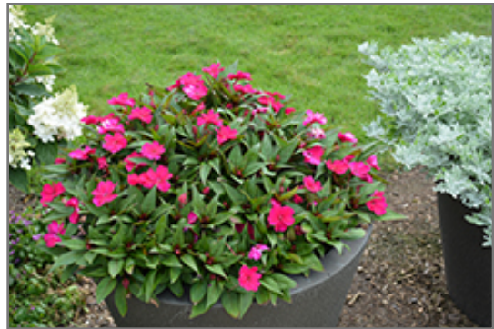
SunPatiens Compact Neon Pink New Guinea Impatiens in bloom

SunPatiens Compact Neon Pink New Guinea Impatiens will grow to be about 24 inches tall at maturity, with a spread of 24 inches. When grown in masses or used as a bedding plant, individual plants should be spaced approximately 20 inches apart. Its foliage tends to remain dense right to the ground, not requiring facer plants in front. This fast-growing annual will normally live for one full growing season, needing replacement the following year.