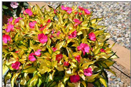
SunPatiens Compact Tropical Rose New Guinea Impatiens in bloom