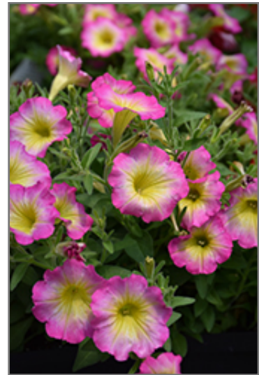
Supertunia Daybreak Charm Petunia flowers

Supertunia Daybreak Charm Petunia is a dense herbaceous annual with a trailing habit of growth, eventually spilling over the edges of hanging baskets and containers. Its medium texture blends into the garden, but can always be balanced by a couple of finer or coarser plants for an effective composition.