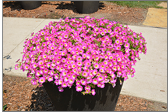
Supertunia Daybreak Charm Petunia in bloom