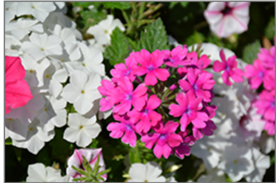
Superbena Pink Shades Verbena flowers

Superbena Pink Shades Verbena is recommended for the following landscape applications;