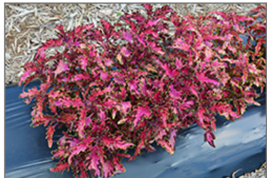
Under The Sea Pink Reef Coleus