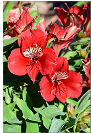
Colorita Kate Alstroemeria flowers

Colorita Kate Alstroemeria is recommended for the following landscape applications;