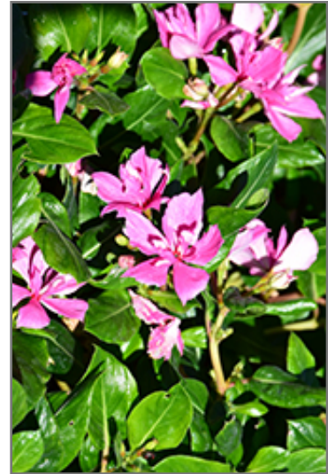
Soiree Kawaii Double Pink Vinca flowers

Soiree Kawaii Double Pink Vinca is recommended for the following landscape applications;