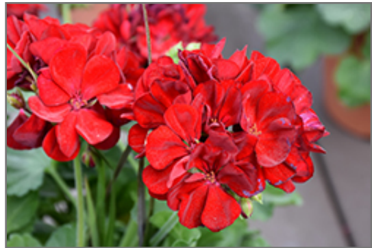
Calliope Medium Dark Red Geranium flowers