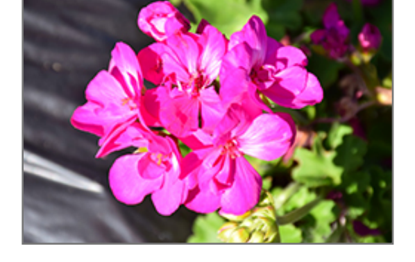
Calliope Medium Deep Rose Geranium flowers